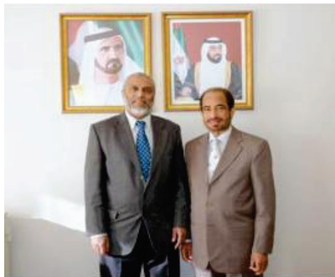
القائم بأعمال السفارة يلتقي رئيس الإتحاد الأسترالي للمجالس الإسلامية Charge d'affaires of UAE Embassy in Australia meets President of AFIC