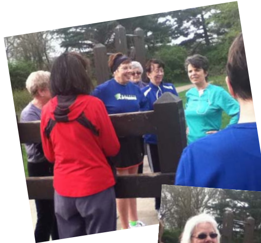
Discussing the morning's walk.