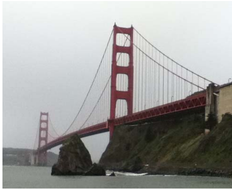
Heading toward the Golden Gate Bridge.