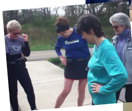
We love to talk about shoes. (Sorry I didn't get the shoes in the photo.)