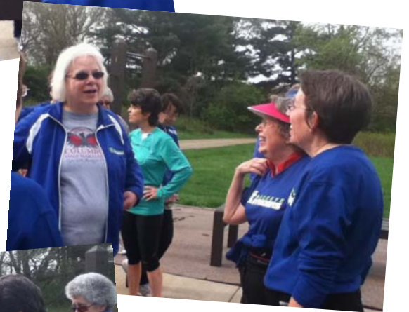
What will we eat for breakfast?