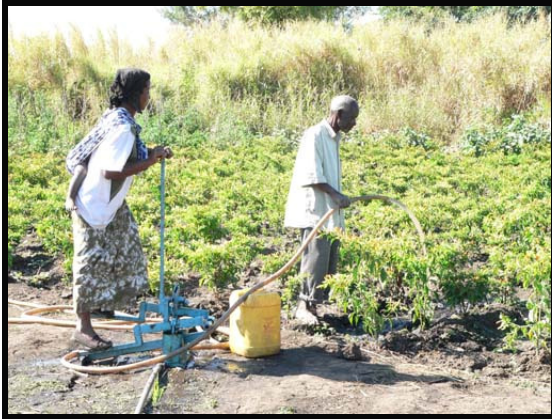
Chitilila farmers using treadle pumps to water chilli plants in dry season.

They are currently harvesting their first crop of chilli for their own use in protecting their fields and also for selling to other farmers.