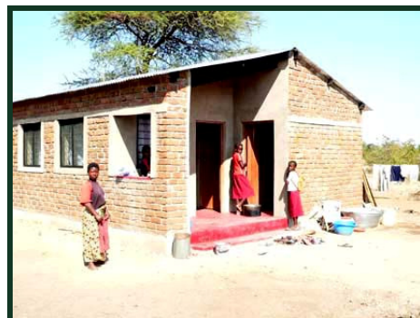
New teachers house at Uyoba.