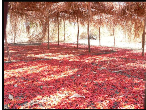
First harvest of chilli being dried in the shade.