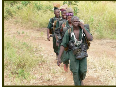
Exhausted but determined to finish.

SLCS is coordinating the course in conjunction with ZAWA and the Nyamaluma Training College. ZAWA's support is much welcomed as is that of Luambe National Park who are sponsoring the training of their scouts from Chitungulu Chiefdom. It is encouraging to see other NGO's getting involved with this training.