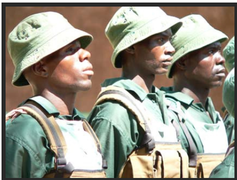
Trainee scouts on parade

unfortunate but is expected, as the course is extremely tough and both phases are designed to root out those who are not physically capable of being law enforcement scouts.