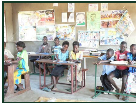
Grade 4 classroom and pupils.