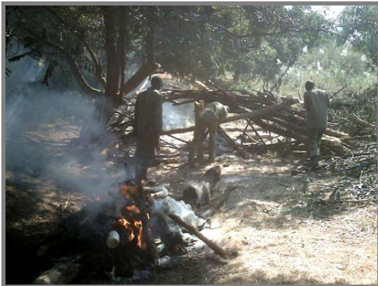
A poacher's camp found in the park while on patrol.

Temporary Fly Camps are being deployed to West Mwamba and Nsefu Sector salt pans. These camps are strategically placed to deny poachers access to the usual poaching hot spots associated with early season. The fly camps will operate until roughly the end of August when the available ground water dries up. They will then move to the permanent water sites targeted later in the year. Both camps will have periodic micro light air support from trustee John Coppinger of Tafika camp.