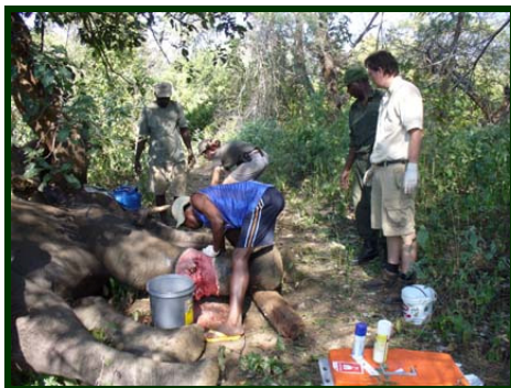
The Lower Zambezi team getting stuck in.