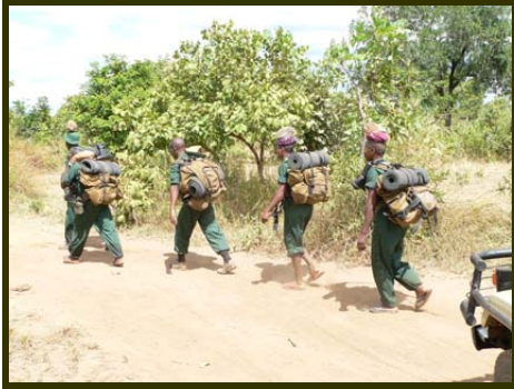
40km route march carrying a full back pack and a heavy stone.

The selection boards include members of the CRB, ZAWA, SLCS and Luangwa Wilderness e.v who made a unanimous decision for those that have failed to be taken off the course. It was indeed very pleasing that the CRB's decided, without our interference that anyone below the pass mark of 60% will not continue the course. This proves that they understand the process and reasoning behind the training and what it means to have fully qualified scouts.