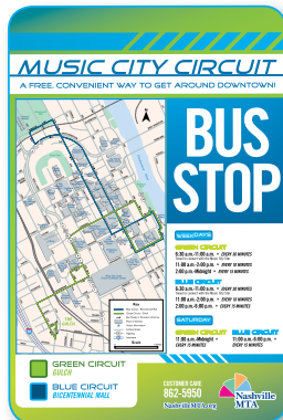
Look for the Music City Circuit bus stop sign.

Whether you're from out of town or live in the neighborhood, the Music City Circuit is the best way to get around once you're here. Frequent stops all around downtown and the Gulch make it a breeze to get to your favorite restaurants, tourist attractions, sporting events, concerts, downtown offices and condos or anywhere else in between. Just board the Green or Blue Circuit at designated stops. These two routes are simple loops, so there is no need for a schedule or large map. Simply review the information in this brochure, on the bus stop sign, online at NashvilleMTA.org or call Customer Care at 862-5950.