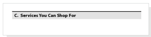
FIGURE 11: SERVICES YOU CAN SHOP FOR TABLE OF THE LOAN ESTIMATE

Services You Can Shop For are provided by persons other than the creditor or mortgage broker and are services that the consumer can shop for and will pay for at settlement. (§ 1026.37(f)(3)) Items listed as Services You Can Shop For must use terminology that describes each item and disclose them in alphabetical order. (§ 1026.37(f)(5))