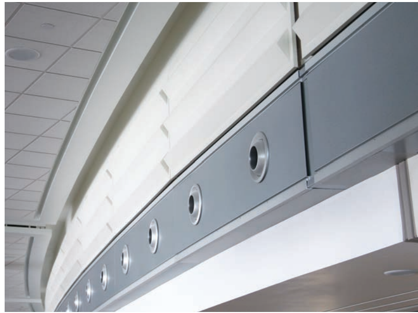
▲ Custom Diffuser Acoustic Panels designed to architect's preferences Top: Captivating skylights with Linear ceiling clouds in background