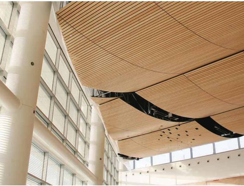
▲ Overlapping white maple veneer Linear open panels with complex curvature Front: Billowing expanse of ceiling clouds across the terminal's upper terrace