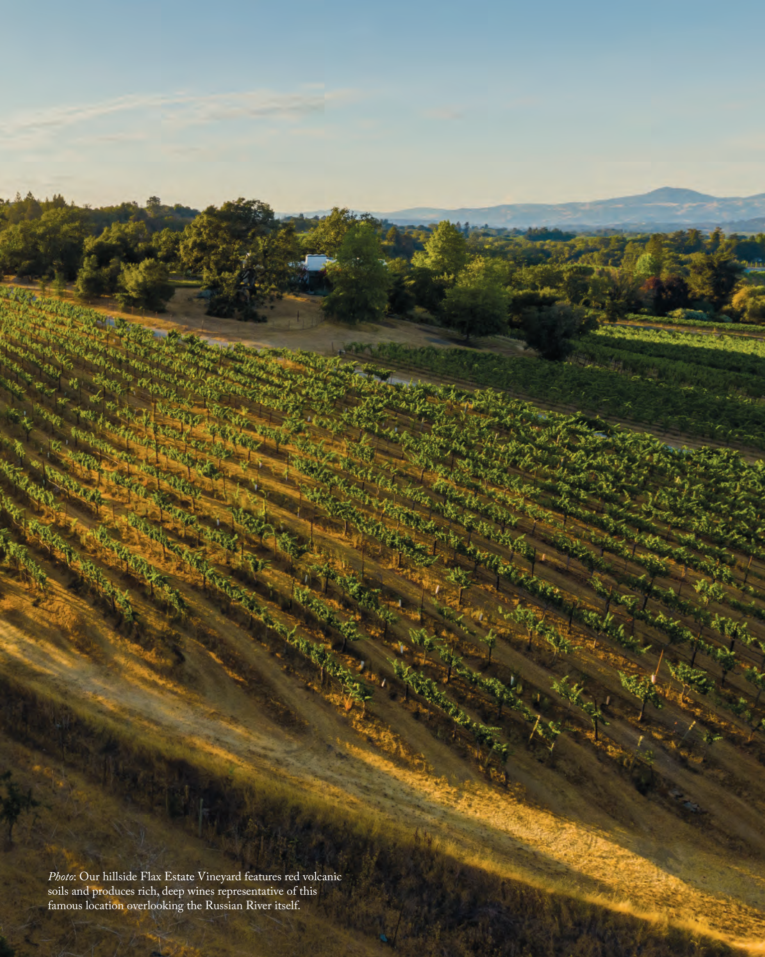
Photo: Our hillside Flax Estate Vineyard features red volcanic soils and produces rich, deep wines representative of this famous location overlooking the Russian River itself.

Founded in 1996, DuMOL is dedicated to crafting highly nuanced, vineyard-focused Pinot Noirs and Chardonnays from distinctive sites in the cool-climate Russian River Valley. Our longtime team remains dedicated to farming our unique vineyards with a sensitive touch, and we are deeply appreciative of the connection forged with you over this time.