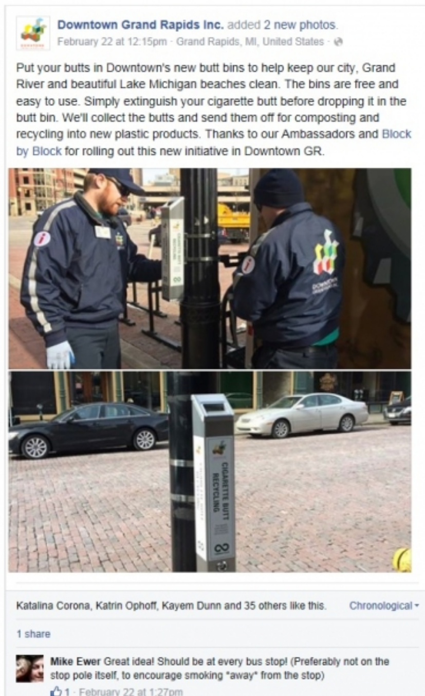
Facebook post and feedback regarding the cigarette urn project