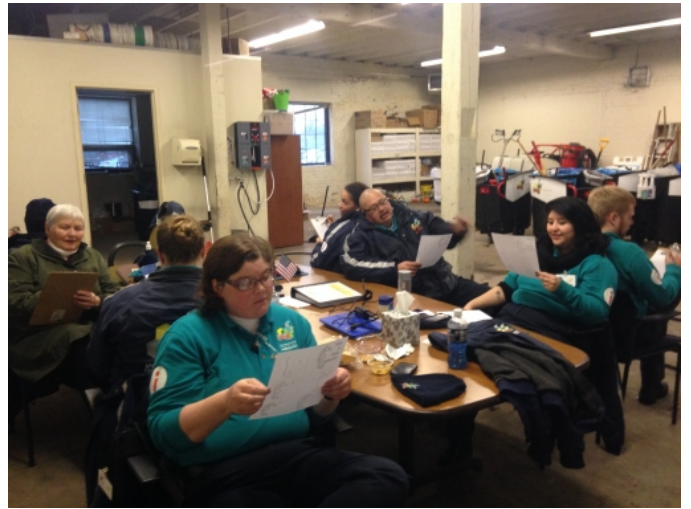
The Ambassador team training in effective communication