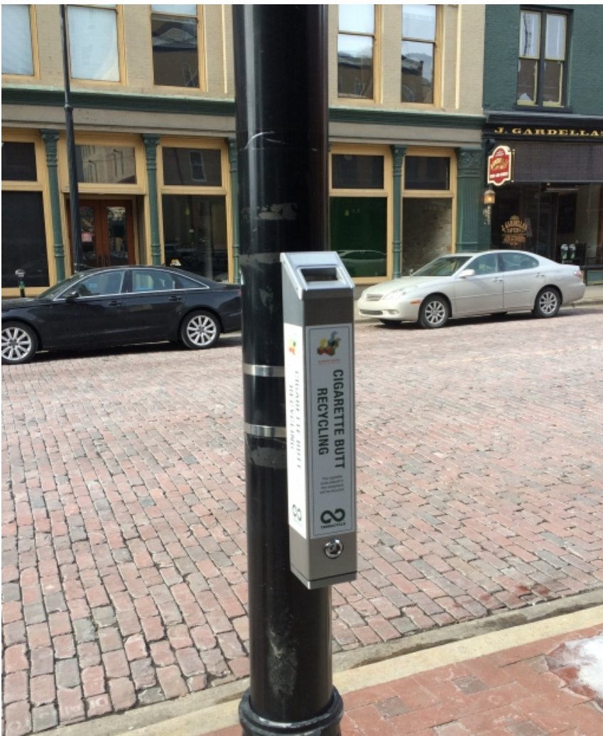
The first cigarette recycling urn installed downtown