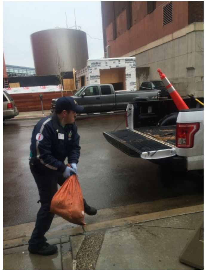
The team picks up left over sand bags near Ottawa Ave.