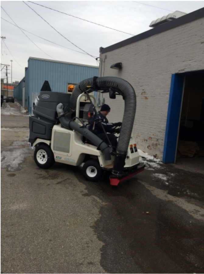
Our new All Terrain Litter Vacuum arrives