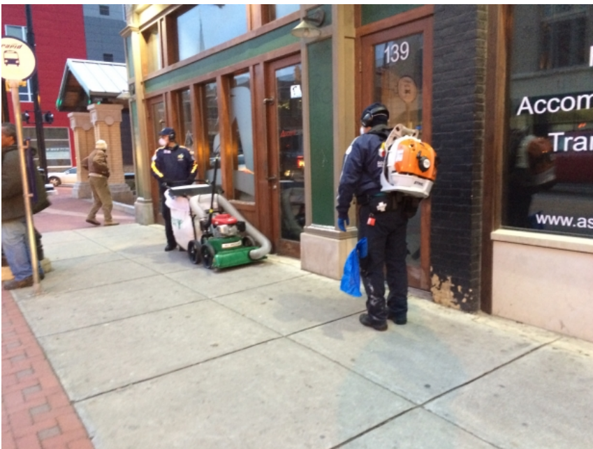
Tyler and Melvin use the blower and billy goat to provide deep cleaning to Division Ave.