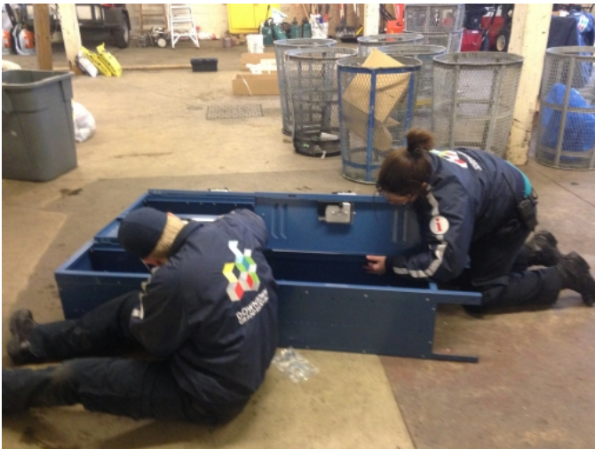
Assembling lockers in preparation for moving our operations center