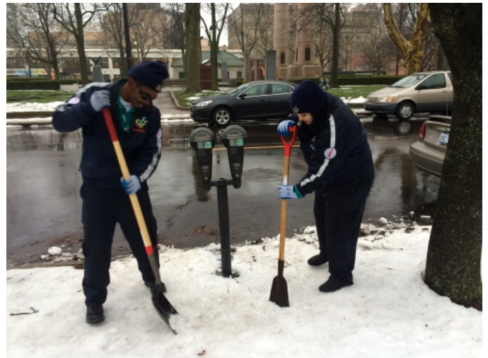
Ambassadors removing snow and breaking ice