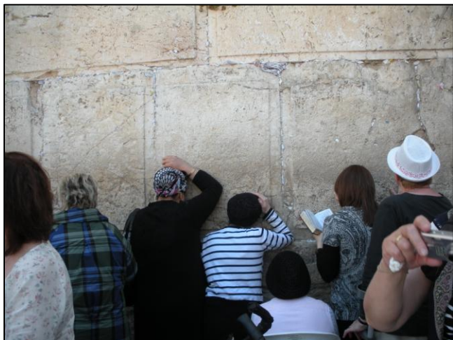
Women at the Wailing Wall.

In early May we took a terrific cruise on a small (600 passenger) ship to the Holy Land and Egypt – and our wonderful tablemates were also from – Florida! We were so glad to have taken the opportunity to see this part of the world before a Muslim government was elected in Egypt and renewed violence erupted in Israel. In addition we spent a few days in Venice, one of our favorite cities, and visited beautiful Dubrovnik in Croatia.