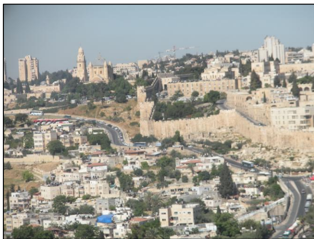
The Temple Mount in Jerusalem