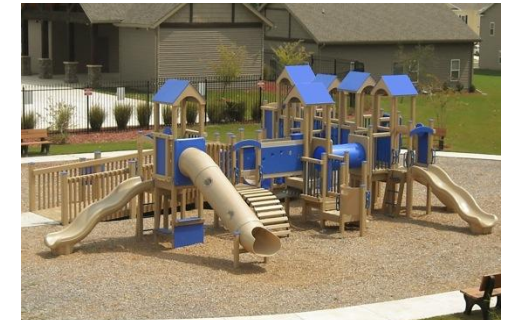
(proposed large playground area)

Building community spirit through recreation.