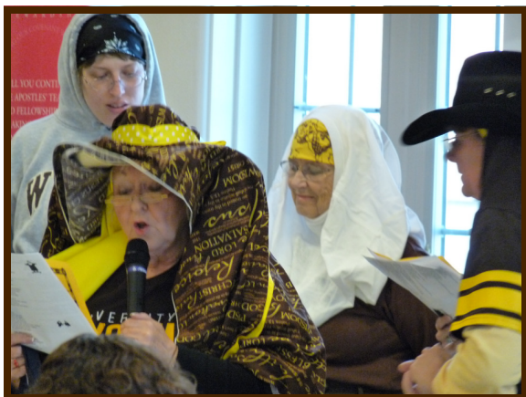
The Merry (Dis)Order of Fun Nuns are a big hit at special St. Mark's celebrations.

St. Mark's is a friendly and warm church with open doors — and open arms — to visitors. We try to make everyone feel welcome and gently engage newer members in activities and ministries. One recently-formed ministry, the Soul Knitters, inspires us with its creations