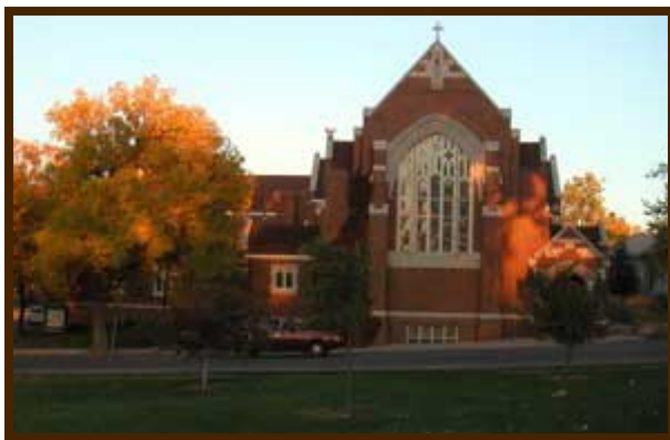
For nearly 90 years, St. Mark's beautiful brick church has been loved by members and the community. Generous bequests, a plate & pledge set-aside and a very dedicated building committee have kept the structure in excellent shape.

Our members seem to have no shortage of generosity. St. Mark's has been a program church for 25 years and is designated a Jubilee Ministry Center. Our Jubilee accreditation is up for renewal in 2011 and we as a parish, along with our new rector, must prayerfully discern whether to pursue re-certification.