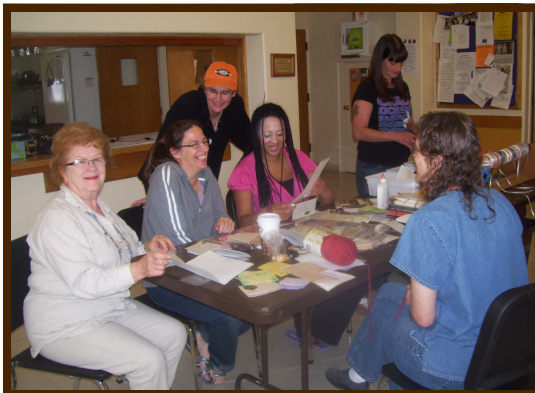
The women in Cross Roads Ministry find faith, friendship and hope as they work to rebuild lives shattered by poverty, abuse and addiction.

One of our most exciting ministries began last year with a one-time "Mustard Seed" grant from the Diocese of Wyoming's Foundation. Cross Roads Ministry has grown into a vibrant Christ-centered ministry which provides paid work, job training, Bible study, fellowship and