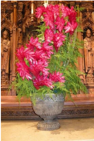
Altar floral arrangement, Pentecost Sunday

Summer provides a wonderful chance reconnect with our families, our community of faith, and our God. Use this opportunity to nurture those things that feed your soul and make your heart sing. Think of summer as an opportunity for spiritual re-creation and renewal and you will find that there is indeed much to celebrate in the world right now.