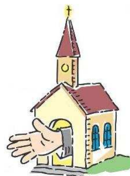
Small(er) Church Ministry