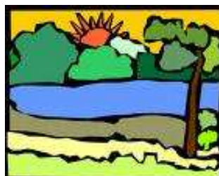
River Adventure Program