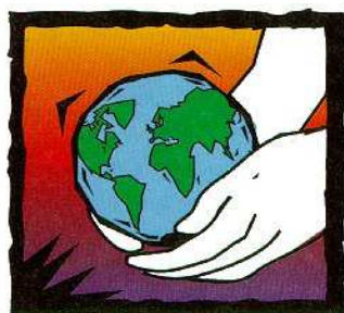
Companions for Mission