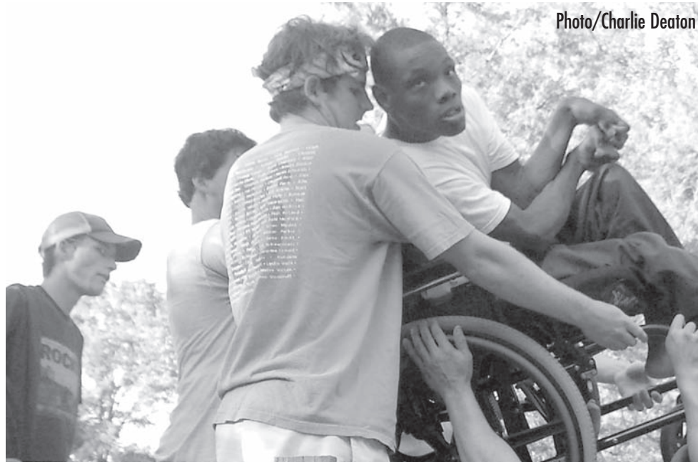
Staff from the guys' wheelchair cabin helping one of the campers out of the trailer at the picnic.