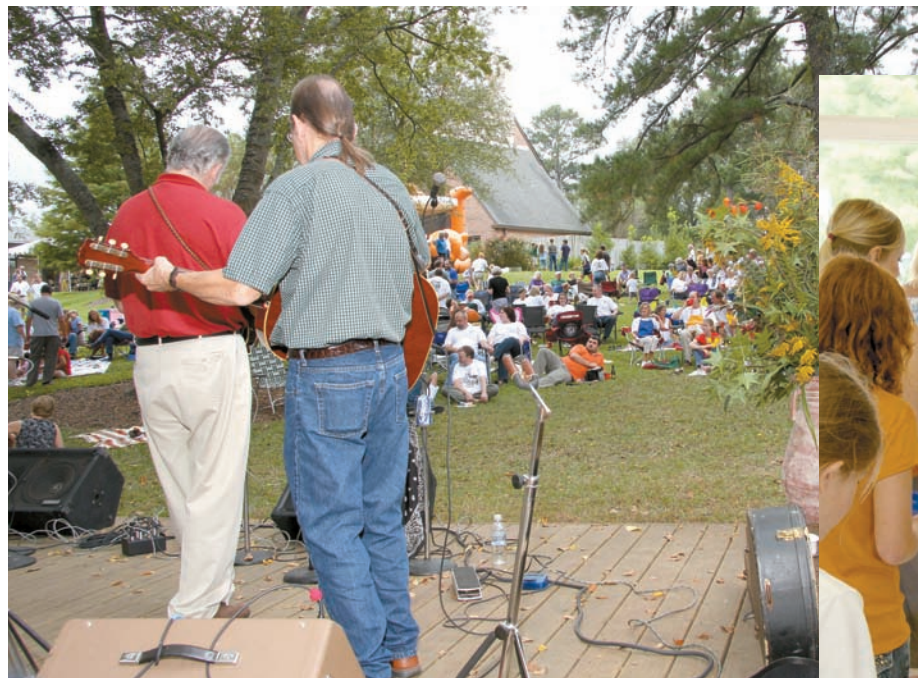
Over 400 parishioners and visitors spread across the hillside to listen to the Vernon Brothers Bluegrass Band entertain at the 27th annual St. Philip's Goat Roast.

Mark your calendars for October 11, 2009 and plan on being at the 28th annual St. Philip's Bluegrass Mass and Goat Roast.