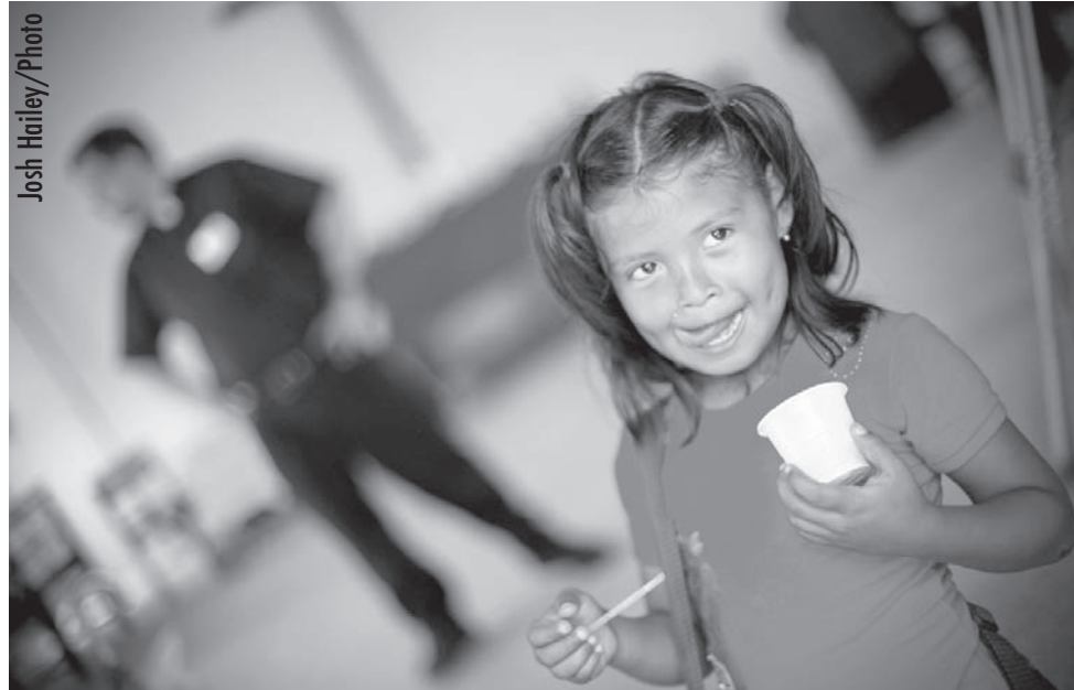
A young Honduran girl visits the medical clinic for her check up with the physicians.