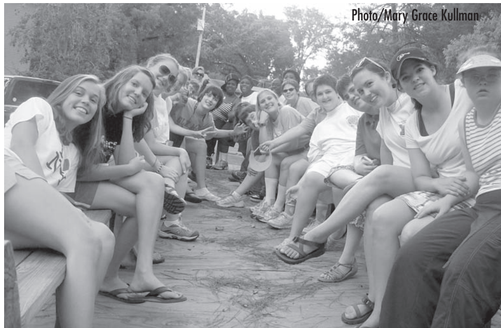
Staff and campers on the "no-bay-bayride" on their way to enjoy a picnic and field games near the Big House.

Beemon Drugs Maywood Mart, Jackson 601-366-9431