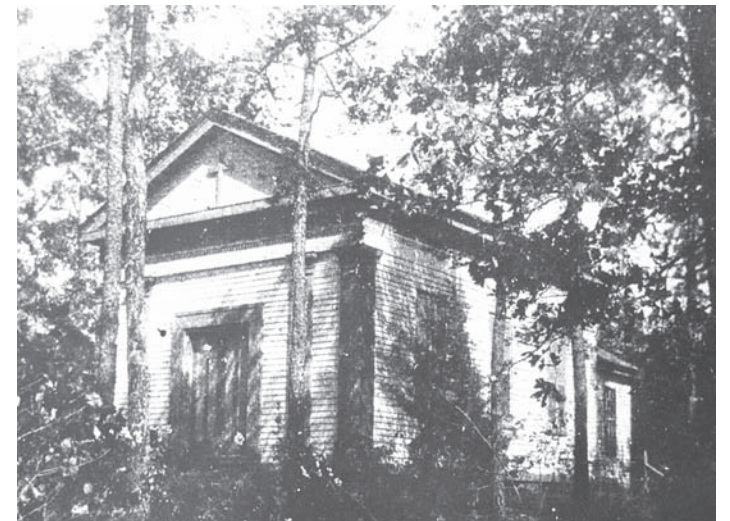
Church of the Holy Comforter, c.1870

When the Dry Grove School declined, references to the center at Terry ended. The Church of the Good Shepherd in Terry continued, however, so it seems unlikely that fortunes of the two were linked.