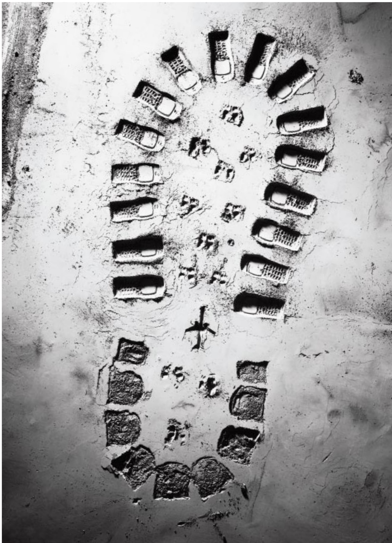
An excessive carbon footprint has become the equivalent of wearing a scarlet letter.