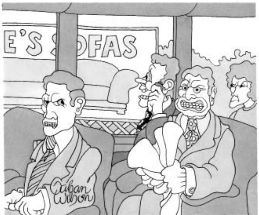
“Now we’re passing by a great big sign urging us to buy sofas!”

Many factors influence the carbon footprint of a product: water use, cultivation and harvesting methods, quantity and type of fertilizer, even the type of fuel used to make the package. Sea-freight emissions are less than a sixtieth of those associated with airplanes, and you don’t have to build highways to berth a ship. Last year, a study of the carbon cost of the global wine trade found that it is actually more “green” for New Yorkers to drink wine from Bordeaux, which is shipped by sea, than wine from California, sent by truck. That is largely because shipping wine is mostly shipping glass. The study found that “the efficiencies of shipping drive a ‘green line’ all the way to Columbus, Ohio, the point where a wine