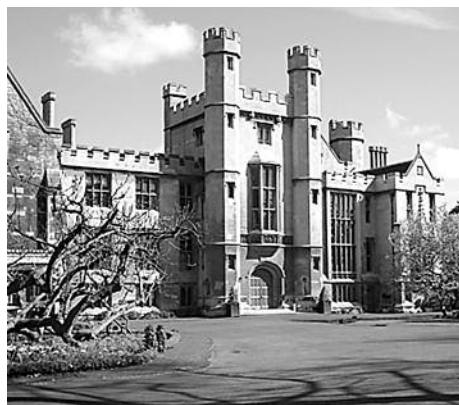
Lambeth Palace, London

We invite everyone to join us any Sunday afternoon at the Methodist Church at 1660 Arbor Way, Turlock, at 3:00 P.M. to share in the Body and Blood of our Lord and Savior. Coffee and good fellowship to follow. We will make sure you have a chair. All are welcome. □