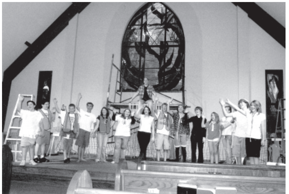
The cast of Godspell