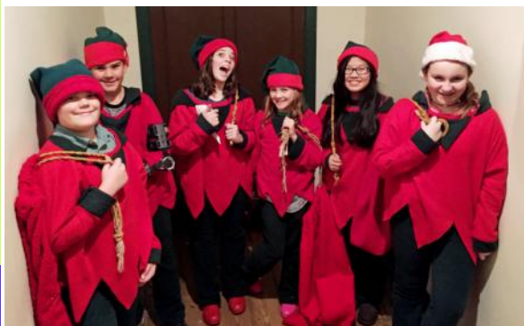
Our youth recently spent the evening volunteering as elves at Santa's Village!

All youth and their families are invited to gather in the church at 3:30pm to help decorate the Nativity Christmas Tree and then go Christmas Caroling around Huntsville.