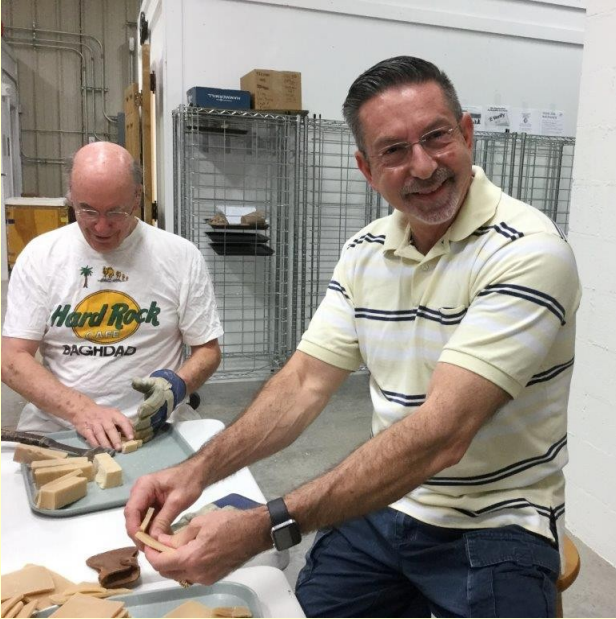
"Apostolic Action", one bar at a time