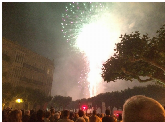
A Fourth of July celebration—not quite— The Feast of St. Peter and St. Paul (June 23rd)