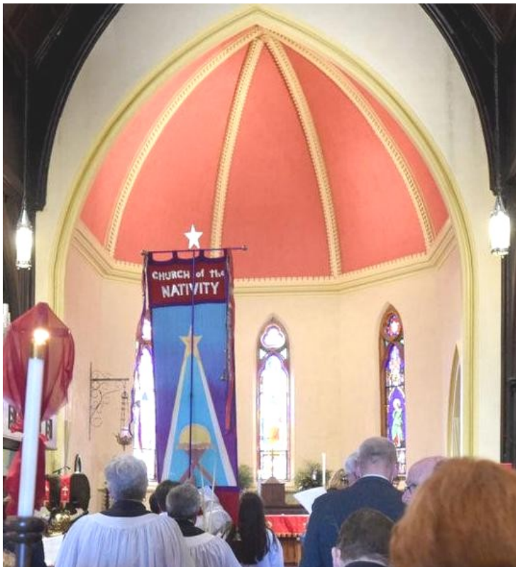
Palm Sunday procession March 29, 2015

The RenewalWorks parish survey results are available by clicking here or on our website ( nativity-hsv.org ) under the 'Parish Life' tab and selecting Renewal Works 2015