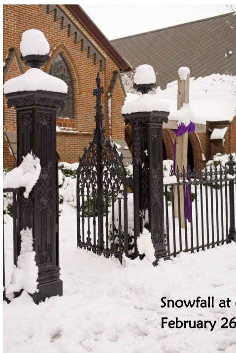
Snowfall at our front gate February 26, 2015

Nativity's Music Line: (256.533.2455 x216)