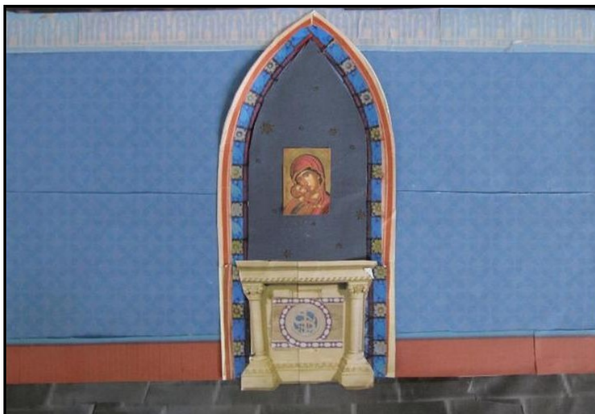
Initial Design Concept

The final design plans for the Lady Chapel are being completed as we can now visualize the expanded space. Meanwhile, there is no interruption of the utilization of the Lady Chapel for the way we return to the nave from the altar. Thanks be to God for those who have given memorial gifts to make this broadening of our spiritual and prayer life possible. We are blessed to worship in the "beauty of holiness" at Nativity and throughout the generations, enhancements have been made by our parishioners generosity, faith and devotion.