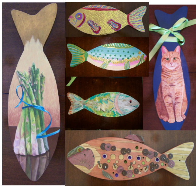
Fish artwork for auction at the dinner.