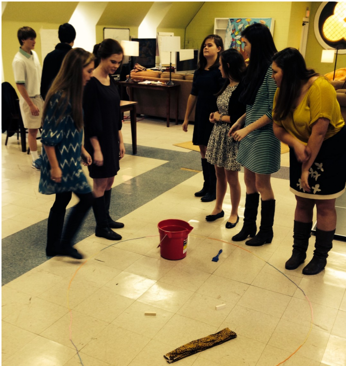
Above, the high school Sunday School class puzzles out the solution to a team building game.