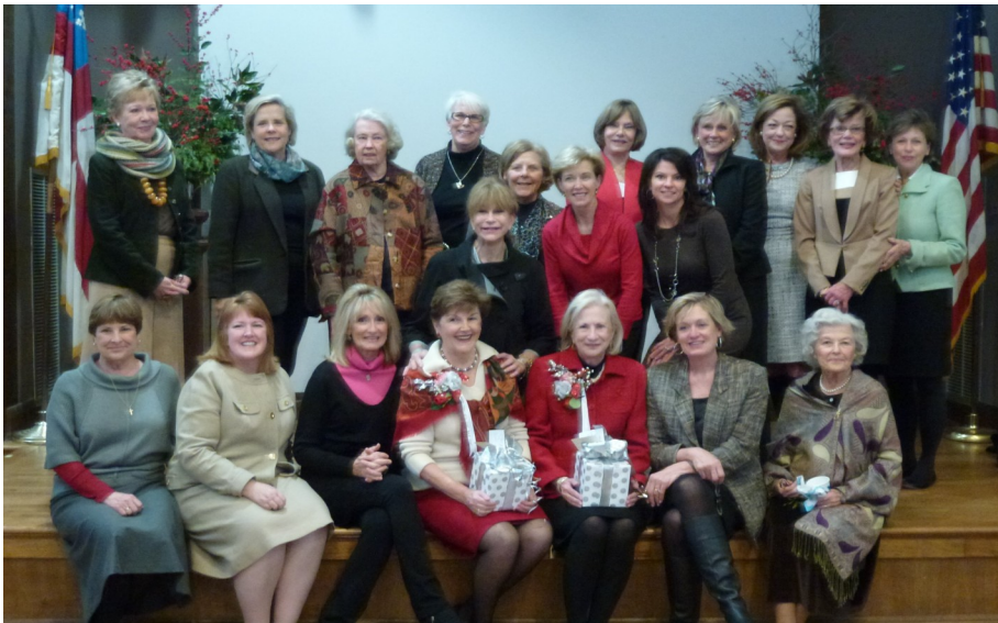
Nativity Flower Guild — 25 years of faithful service!