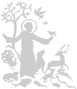
St. Francis of Assisi, patron saint of animals and the environment

You may bring your beloved pets and creatures to the 8:45 a.m. service (on leash or in crate.) The pet blessing follows immediately afterwards at approximately 9:30.