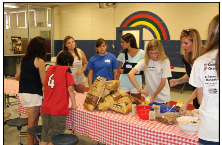
Nativity youth and parents setting up lunch for the Sawyerville staff on 7/20. Great job all!