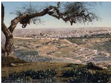
From Mount Scopus, Jerusalem

Holy Land Pilgrimage packages still available for travel from Huntsville International, Friday October 12 returning to Huntsville, Saturday October 27.