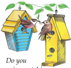
Do you enjoy watching the birds in your own backyard?