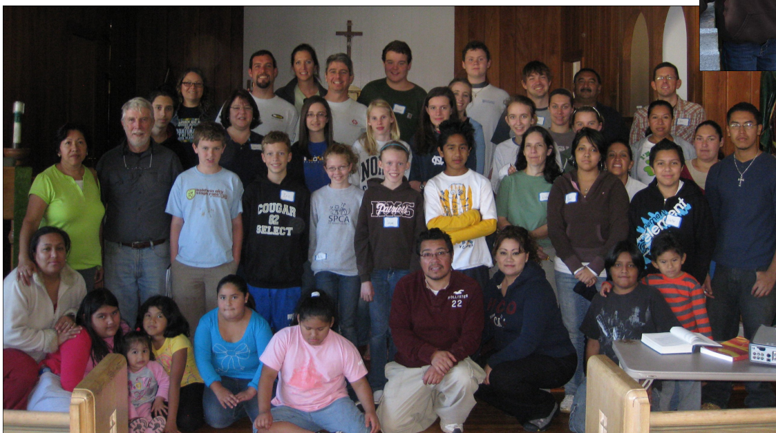
St John’s and the East Region Youth at El Buen Pastor Community Service Day.