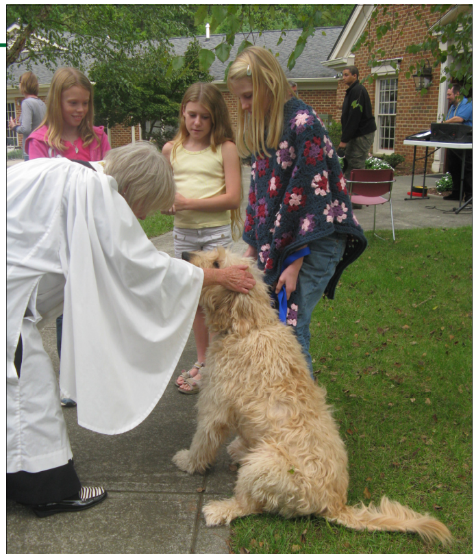
Scenes from the Blessing of the Animals service held on October 3.