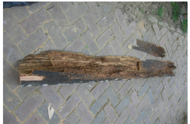
CCIB PHOTOS September 7, 2011