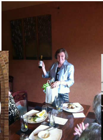
TOHG Brunch at Grill 29