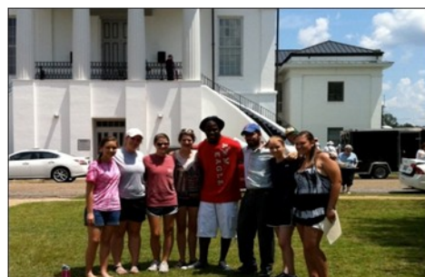
The whole group of youth and youth leaders. The group consisted of folks from Grace Anniston, Ascension Montgomery, and Nativity Huntsville.

learning about how these people were killed. It was a great weekend and we would highly recommend it for anyone, adult or youth, to be a part of it in the future.