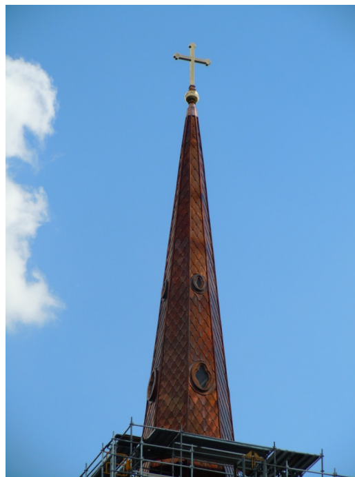
After partial scaffolding removal