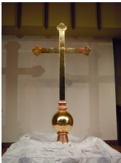
View while on display in Ridley