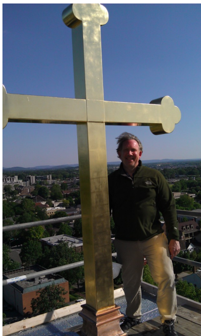
The Rector's view from the top