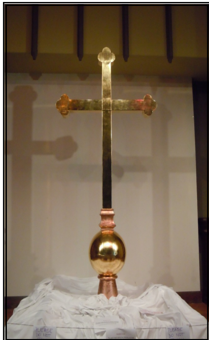
Photo taken while cross is on display in Ridley Hall. You are welcome to observe its beauty while at eye-level.