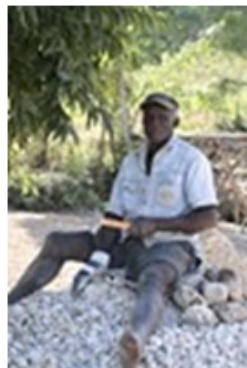
Haitian worker crushes rock to make gravel and sand for construction of the new St. Albans Episcopal Church in Crochu.