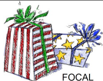
FOCAL Gifts for Foster Children