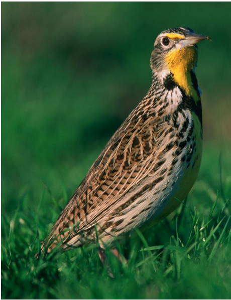
Gary Kramer, USFWS