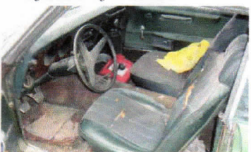
This was the prerestoration interior of the Firebird.

There were 3232 Sprint engines installed and this number was split between Firebirds and Tempests. The records do not indicate exactly how many 1969 Pontiac Firebird Sprints were produced, most likely less than 2000 and this Firebird is one of them, a rare survivor.