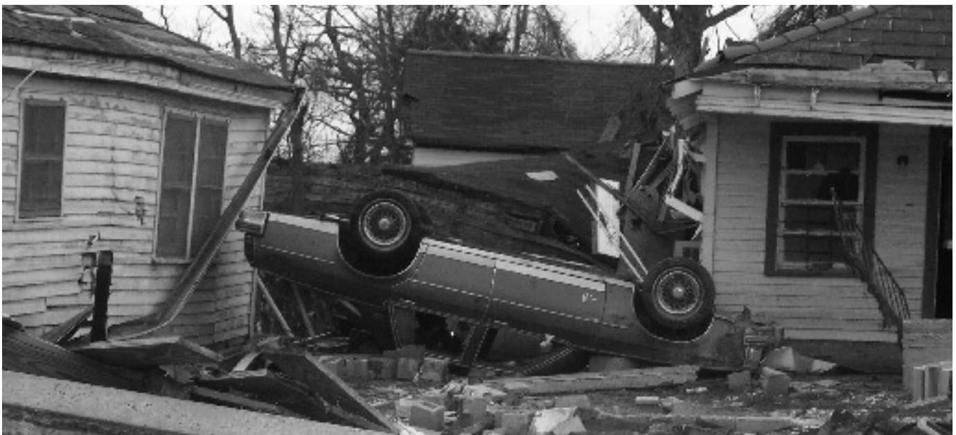
Debris remains where it was deposited in the Lower Ninth.

But a few billion here and there of unwasted taxpayer money can't hurt.