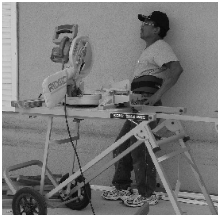
A Latino day laborer at work in Mississippi.