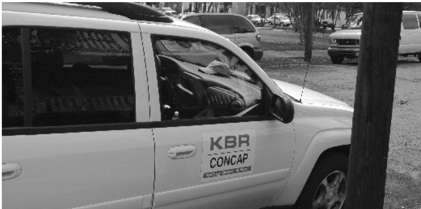
Kellogg Brown & Root has contracts from the Navy, Department of Defense, and the Army Corps of Engineers on the Gulf Coast.