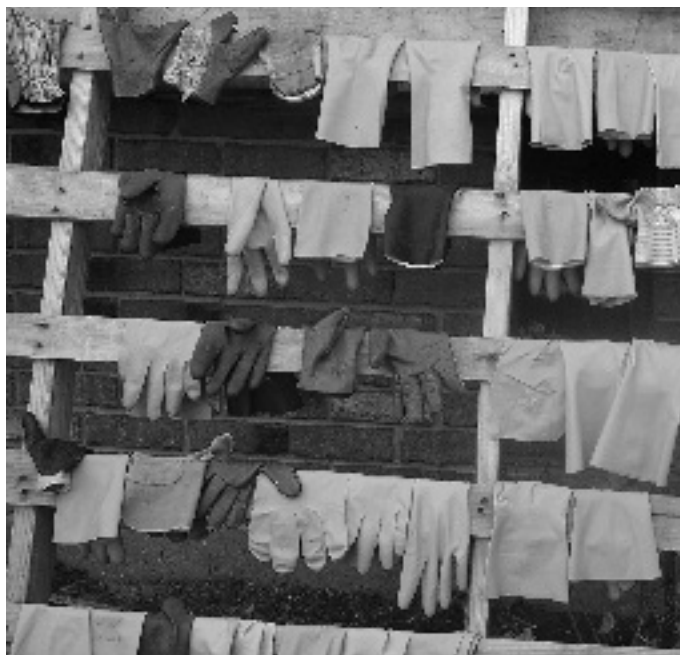
Decontaminated gloves hang to dry at Common Ground's Upper Ninth Ward headquarters.