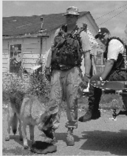
Cadaver dogs and their handlers still find bodies a year later.

And the questions lingered: why was it taking so long to recover bodies, why were they still being found weeks and months later, and why were so many going unidentified for so long? New Orleanians were pestering the DHH for answers and help, sometimes calling multiple times to tell the state that they believed there were bodies at specific addresses. 83 When Kenyon