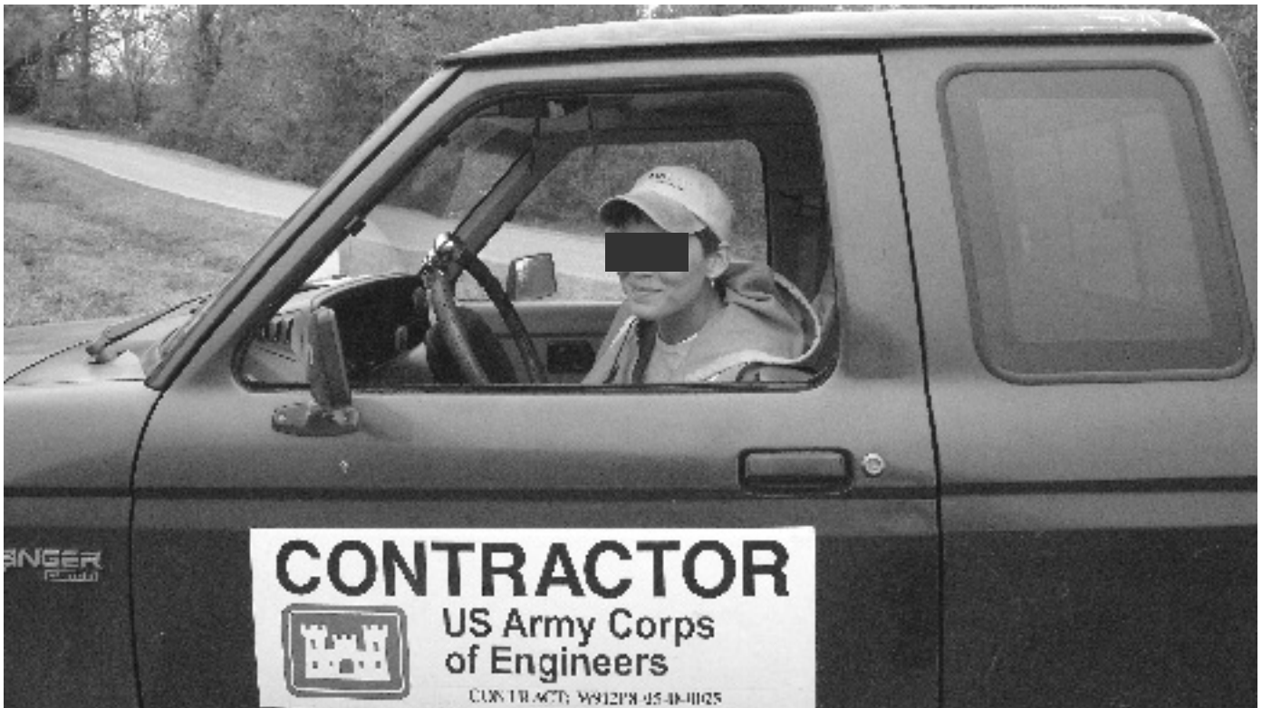
A contractor in Mississippi.

Florida-based Carnival won a $236 million no-bid contract to house hurricane victims, despite the fact that the nation of Greece offered the use of ships for free. Jeb Bush pushed for the