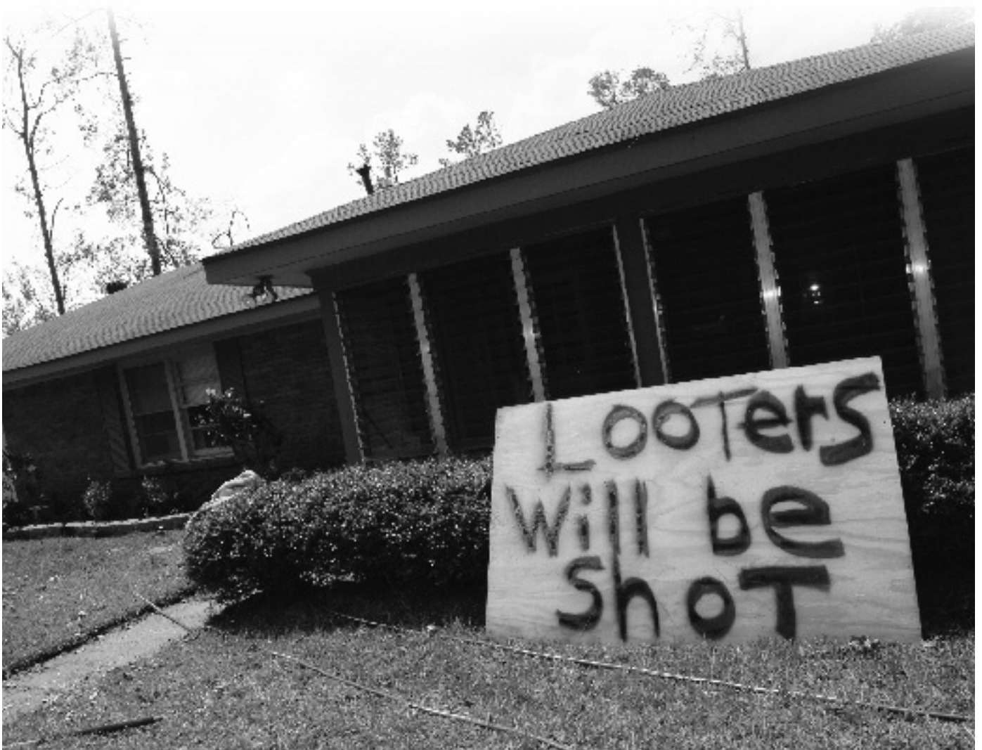
A common sentiment in New Orleans suburbs.