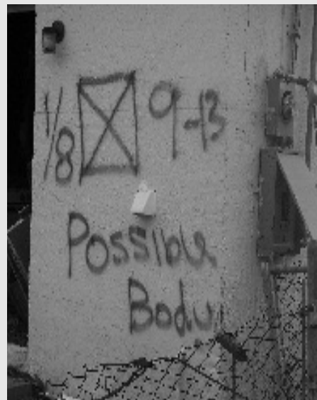
Search and rescue personnel note locations of remains in the Lower Ninth Ward.