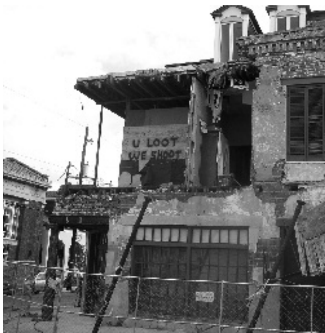
Armed civilians rivaled private security for firepower.

His division generated approximately $1 billion in revenue last year, he said. Since the merger two years ago with Group 4 Securicor, Wackenhut’s mission has gone global.