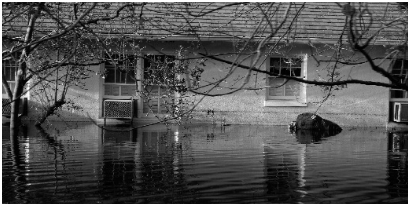
A bloated body partially wrapped in a garbage bag bobs in flood waters in the Lakeview neighborhood of New Orleans.