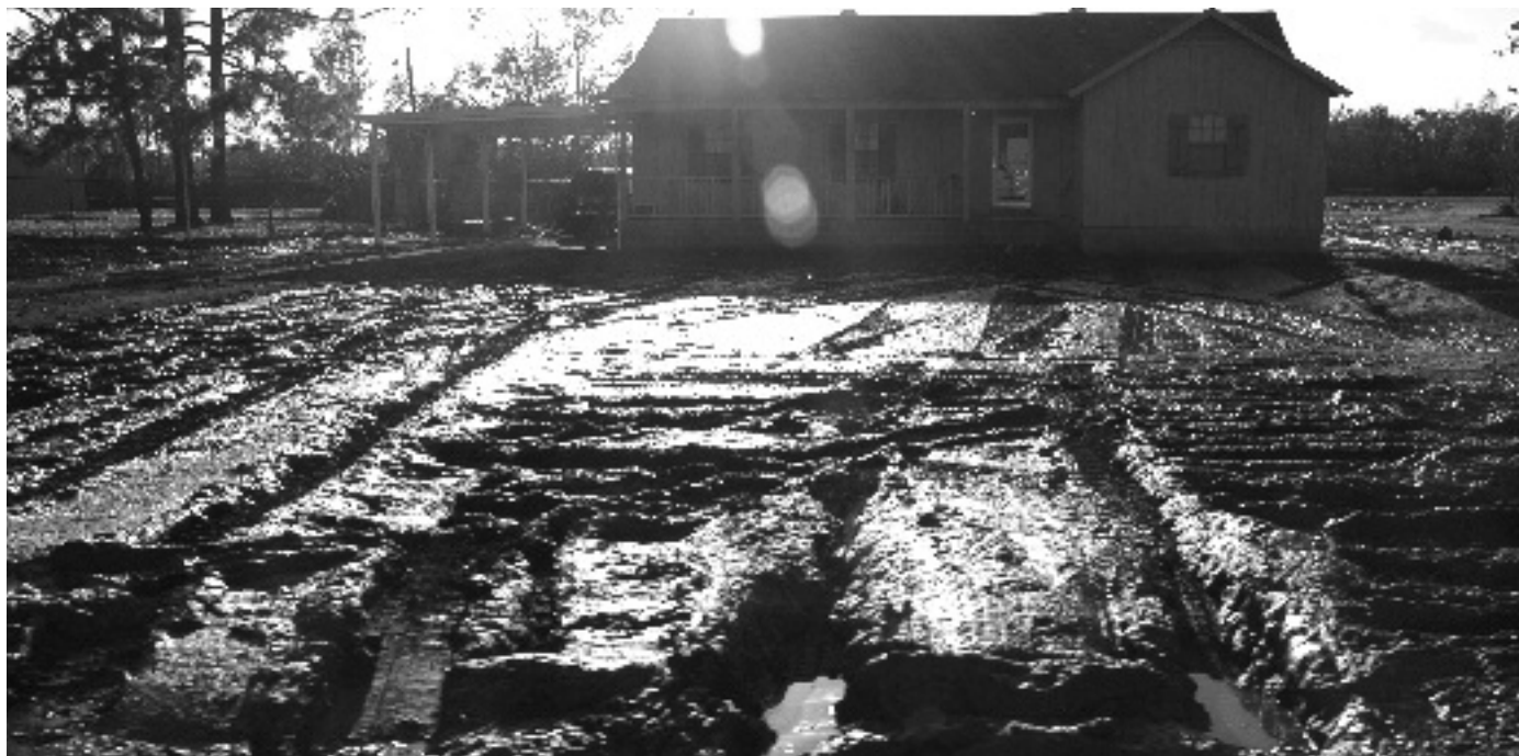
Chalmette was inundated with toxic, oily mud from a leaking refinery operated by Murphy Oil.