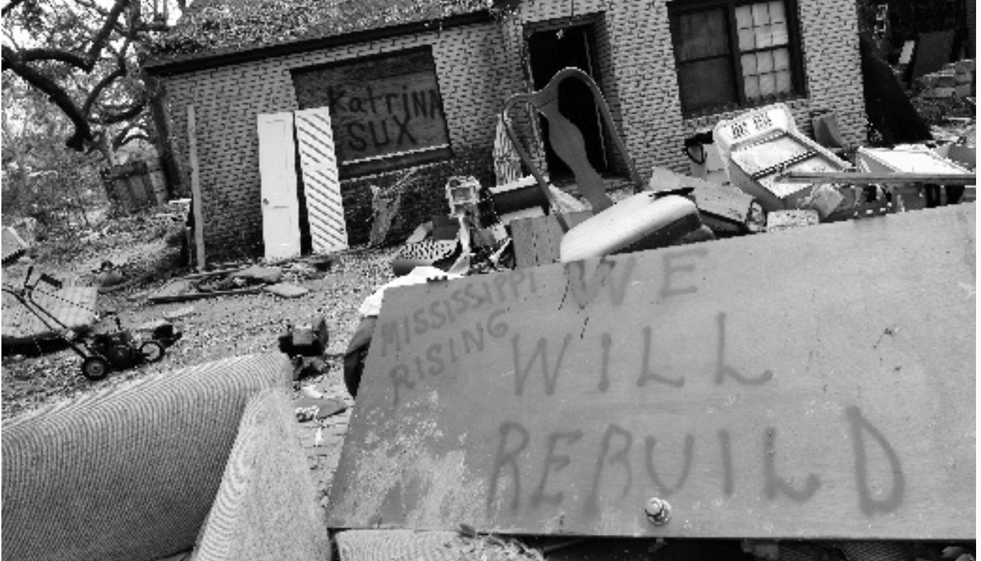
Hope springs eternal in Mississippi.

really cost, because his company's headquarters were under several feet of water. Everything was recorded on paper.