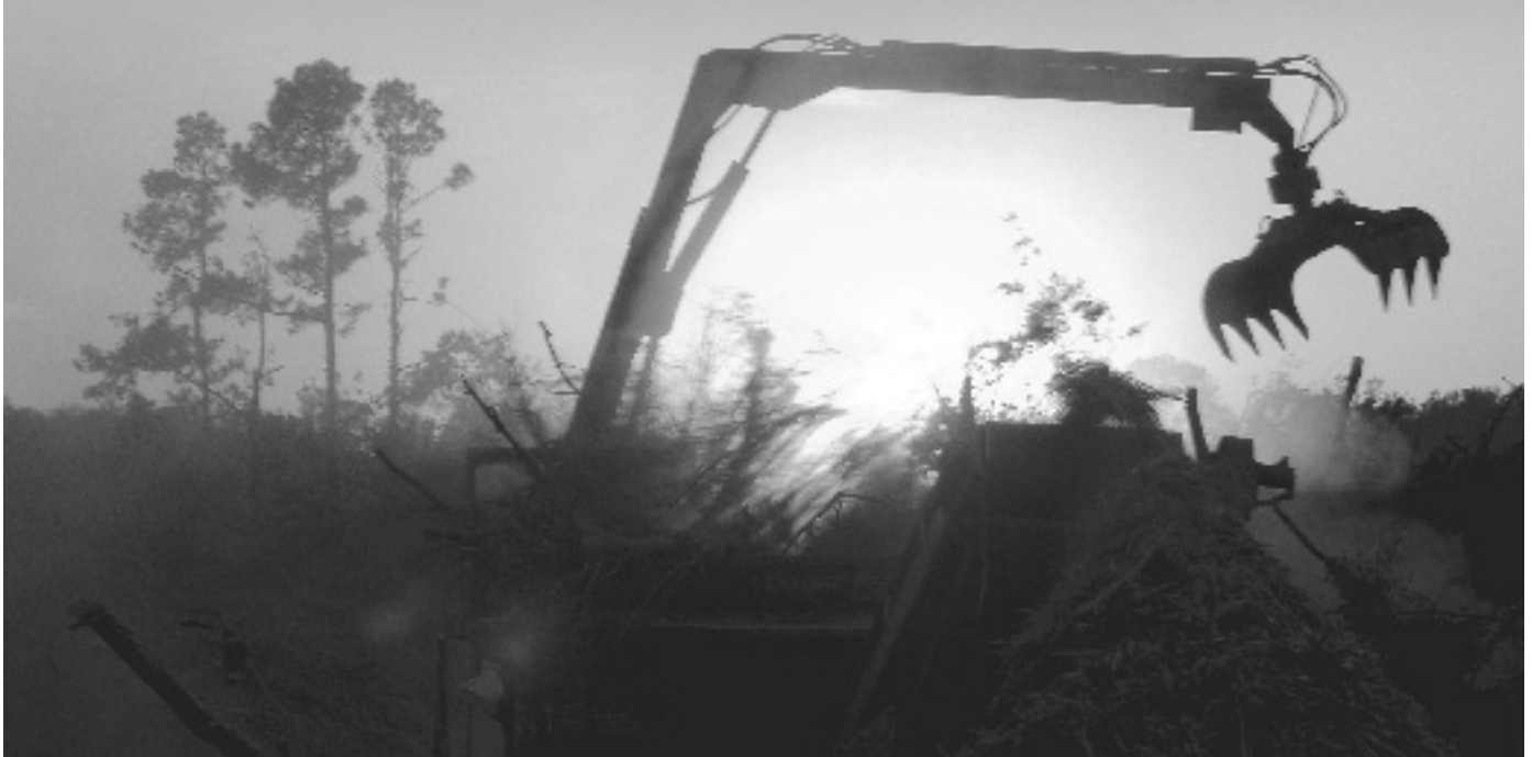
Downed trees are mulched by Ashbritt at a Mississippi dump site.