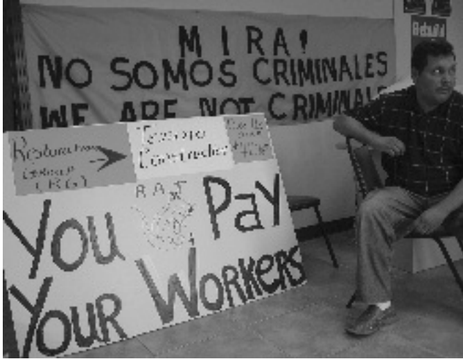
The offices of the Mississippi Immigrant Rights Alliance.