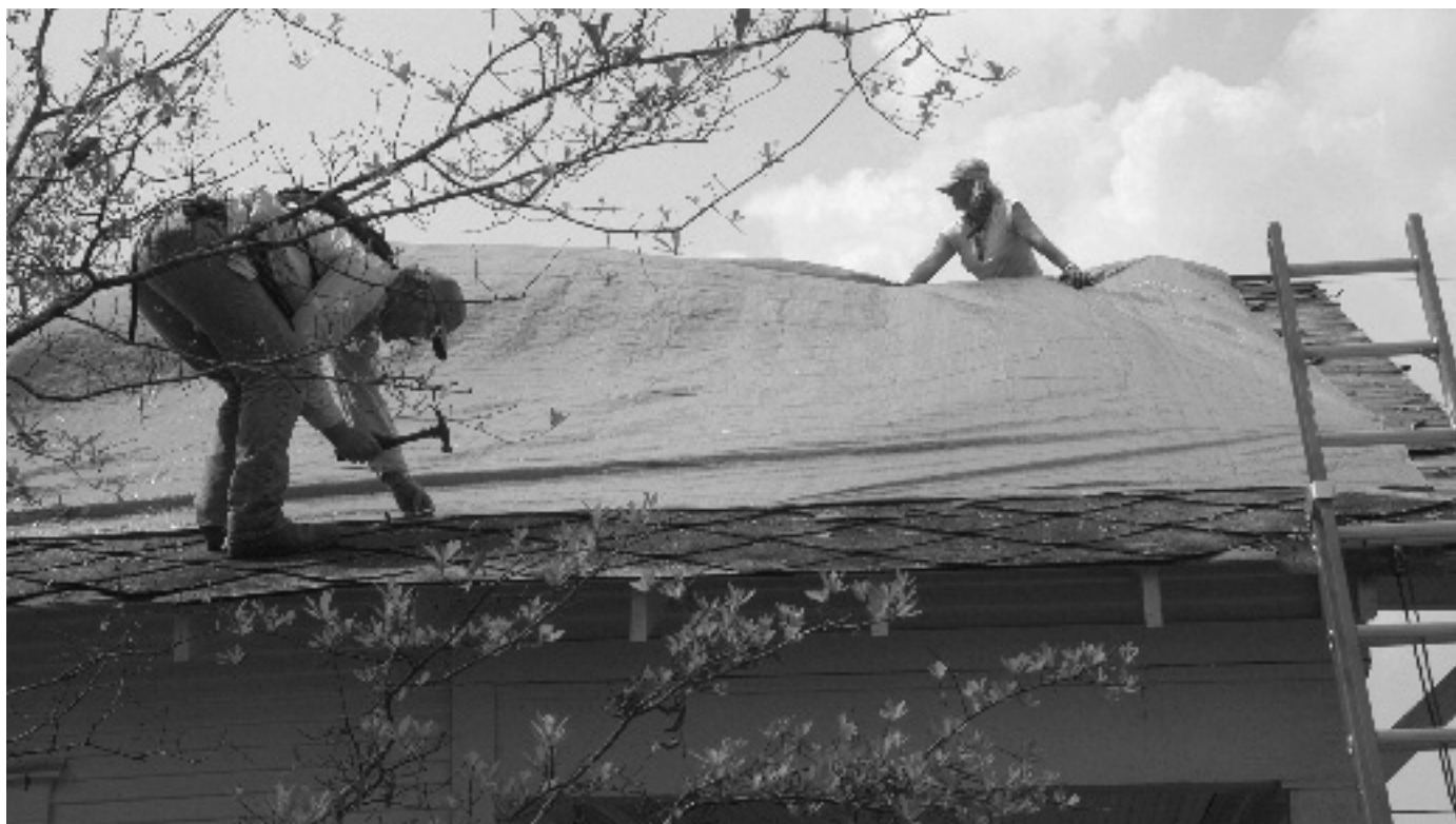
Local church volunteers install a blue tarp for free for a neighbor in Mississippi.

The lure of subcontracting was made even more tantalizing on Sept. 7, 2005, when President Bush suspended the Davis-Bacon Act in the region. The act dictates minimum wages for work on federal contracts; without it, primary contractors and