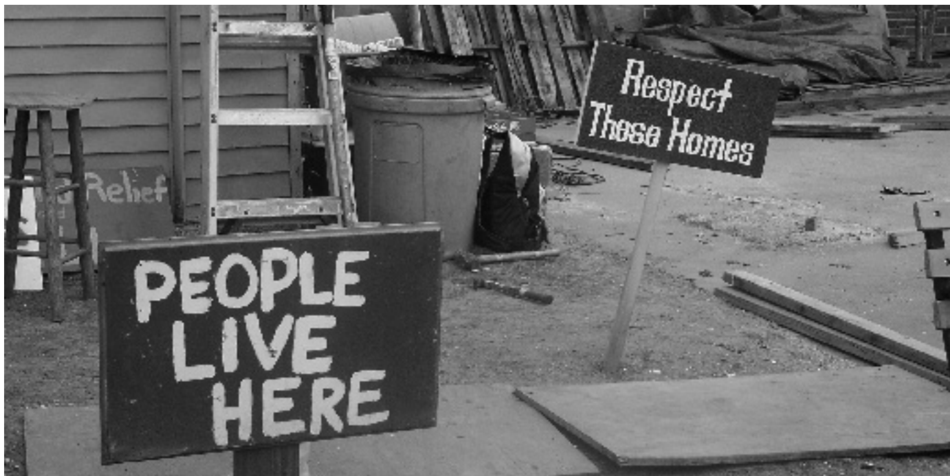
In front of Common Ground's Lower Ninth headquarters.