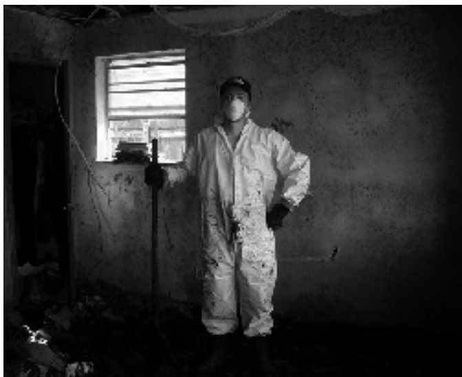
A volunteer helps clear the toxic mud from a home in Chalmette.

The subcontractor hauling the remains of gutted and bulldozed buildings may “tip” their debris into the landfill for $5 a cubic yard. With between 7,000 and 9,000 yards being hauled into the 87 acre facility each day, WMI is earning between $35,000 and $45,000 daily in tipping fees.