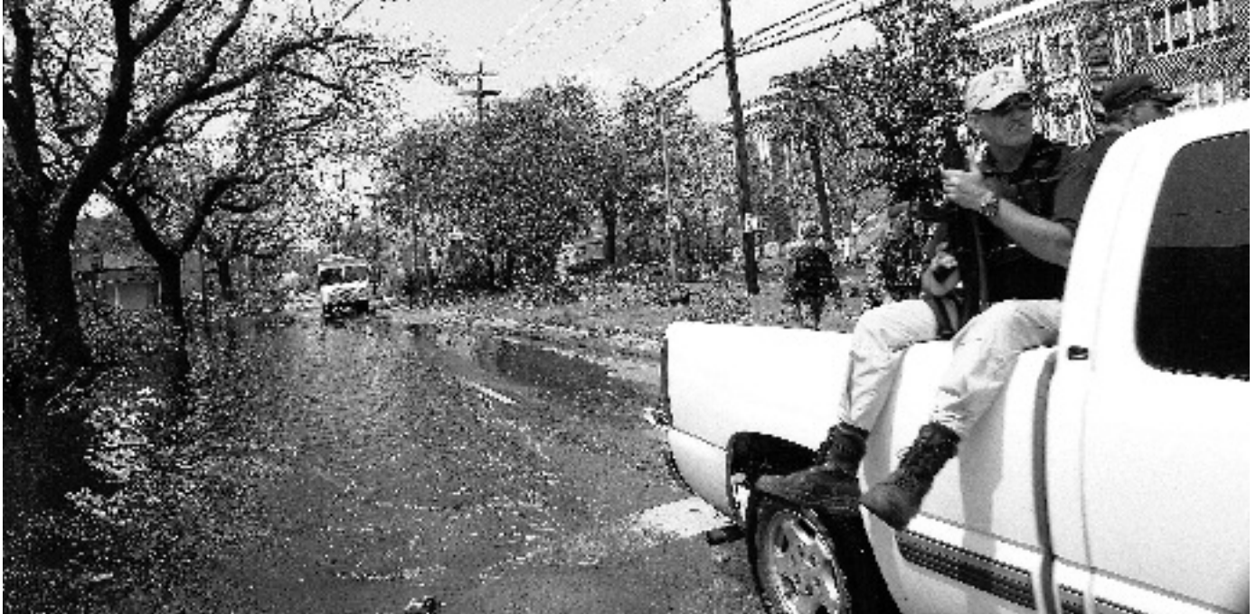
A private security caravan patrols the Ninth Ward.