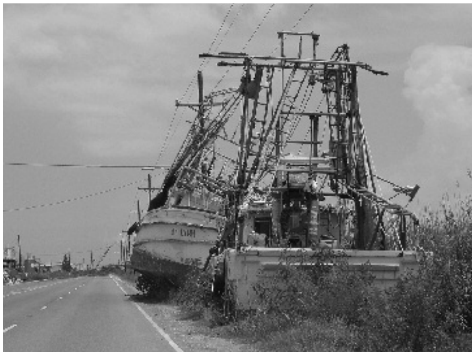
Boats still on the shoulder in East New Orleans.