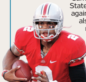
Ohio State QB Terrell Pryor

Games at No. 8 Penn State and home against No. 21 Iowa also loom large. But no other Top 25 opponent is on Ohio State's relatively manageable schedule.