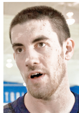
Nick Collison Forward/Center Seattle