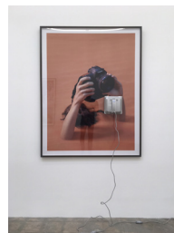
DIS Serenity Now , 2016 Framed C-print Winbot W830 65h x 30.38w x 2d in 4/5 + 2 AP DIS001