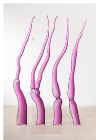
Katja Novitskova Approximation (C. Elegans Dendrite Endings: ASR, ADF, ASG, ASH) , 2016 Digital print on aluminum, cutout display, and plexiglass 99.25h x 68.50w x 26.25d in KN001