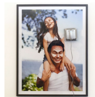
DIS Image Life , 2016 Framed C-print and Winbot W830 65h x 50.38w x 2d in 2/5 + 2 AP DIS003