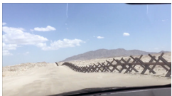
Christopher Kulendran Thomas 60 million Americans can't be wrong , 2018 HD video, 27:15 min 1/5 + 2 AP CKT010