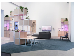
Christopher Kulendran Thomas New Eelam , 2018 In collaboration with Annika Kuhlmann Aluminum, plywood, steel, silicone, latex, water, pump, clay, grow lights, various plants dimensions variable CKT011