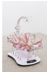
Katja Novitskova Mamaroo (Storm Time 3D Embryo) , 2016 Electronic baby swing, polyurethane resin, epoxy foam clay, wall fixtures, robotic bugs, and 3D print 31h x 28w x 33d in KN003