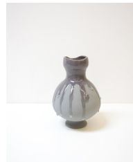
Liz Magic Laser Screaming Vase , 2016 Ceramic, lacquer, wood, polyurethane foam, vinyl, thread and Velcro 14h x 10w in 1/3 + 2 AP LML074