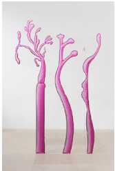
Katja Novitskova Approximation (C.Elegans Dendrite Endings: URX, URAV) , 2017 Digital print on aluminum, cutout display, and plexiglass 91.50h x 59.38w x 25d in KN002