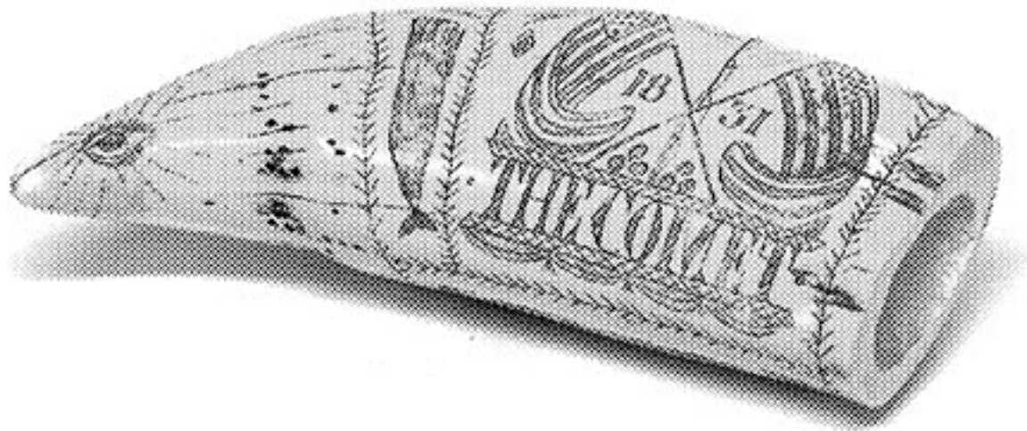
"The Comet" scrimshaw whale tooth resin replica, by Juratone Ltd, England. Patriotic device: USA flags, harpoon, 6 cannonballs, labeled "THE COMET," dated 1831; a spouting sperm whale, harpoons; mystic eye at point; signed "D. Hart."