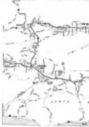
#2 - Thousand Oaks Simi Valley Malibu