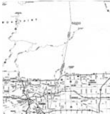
#5 - Pomona Ontario