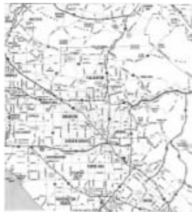
#8 - Whittier Fullerton Anaheim Orange