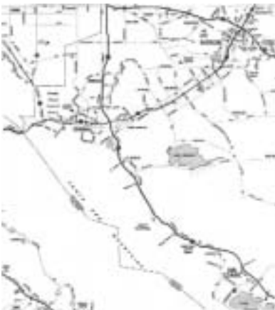
#7 - Corona Riverside