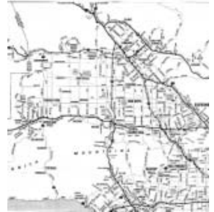
#3 - San Fernando Valley Hollywood/ Burbank Beverly Hills/ W. Hollywood Century City/Westwood