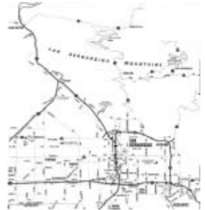
#6 - San Bernardino Redlands