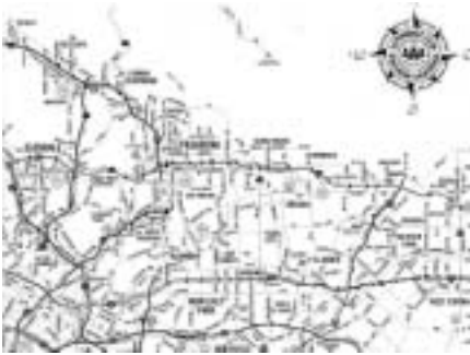
#4 - Glendale / Pasadena Monterey Park / Rosemead West Covina