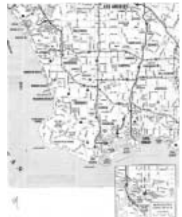
#9 - Compton South Bay Long Beach