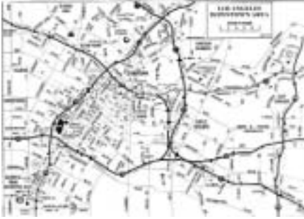
#1 - Los Angeles (Downtown)