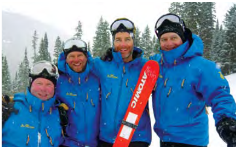
McBride Million Footers and CMH Heli-Ski aficionados at the end of a big day!

It was another year of extraordinary skiing and you, our loyal guests, racked up more and more metres once again. Congratulations to all on reaching your Million Foot milestones this past winter!