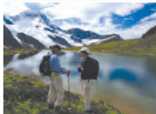
Heli-Hikers exploring the spectacular terrain during the inaugural Adamants & Monashees Lodge-to-Lodge trips.