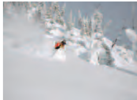
Monashees, December 2005