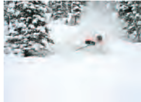
Galena, December 2005