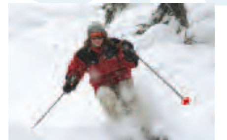
Heli-Skiing: It's not just for the guys!

Our limited trip space will fill quickly. Call us at 1.800.661.0252 or visit our Web site at www.CanadianMountainHolidays.com to book now!