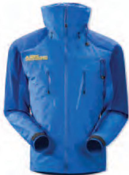
The Arc'teryx Neos line is exclusive to CMH.

This outfit is the perfect execution of a user-specific design to create the ultimate mountain gear for demanding enthusiasts.