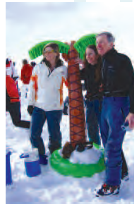
Beats Fort Lauderdale for a Family Spring Vacation.

Kids should be between the ages of 12 and 17, and pay half the adult trip price. Adults are guaranteed 30,500 vertical metres (100,000 vertical feet) and kids are guaranteed 15,250 vertical metres (50,000 vertical feet). When the children tire of skiing, they are flown back to the lodge for supervised fun activities. Kids who choose to ski the entire time can continue skiing at a rate of $85/1,000 m. Their final tally for skiing 30,500 m is still lower than that of an adult.