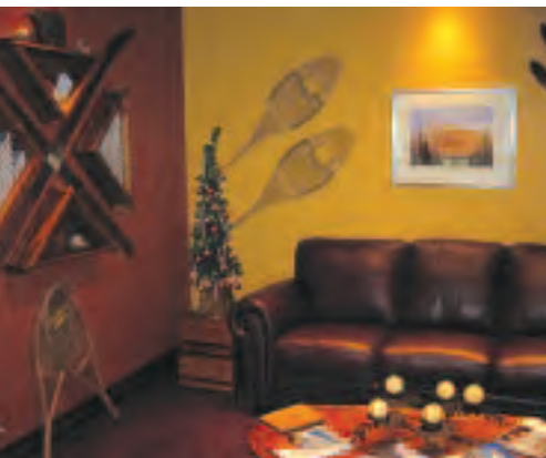
CMH Mementos in the Delta Calgary Airport Hotel.