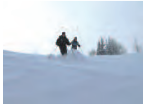
Bugaboos, December 2005