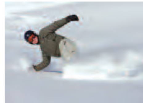
Valemount, December 2005

Picture yourself in any one of these photos, all taken in early December 2005.