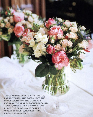
TABLE ARRANGEMENTS WITH THISTLE, PARROT TULIPS, AND ROSES. LEFT: THE PROCESSION FROM THE CHATEAU'S ENTRANCE TO NEARBY ROCHEFOUCAULD TOWER, WHERE THE CEREMONY TOOK PLACE. THE BRIDESMAIDS CARRIED WHEAT BOUQUETS, REPRESENTING FRIENDSHIP AND FERTILITY.