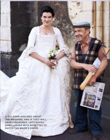
A VILLAGER INQUIRES ABOUT THE WEDDING, AND IF THEY WILL HAVE FIREWORKS. LEFT: SHOES EMBELLISHED WITH ROSETTES TO MATCH THE BRIDE'S DRESS.