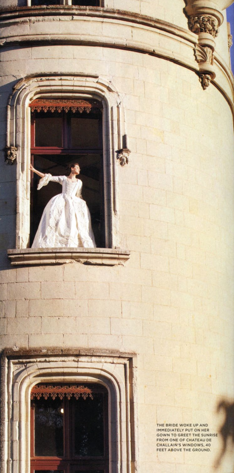
THE BRIDE WOKE UP AND IMMEDIATELY PUT ON HER GOWN TO GREET THE SUNRISE FROM ONE OF CHATEAU DE CHALLAIN'S WINDOWS, 40 FEET ABOVE THE GROUND.