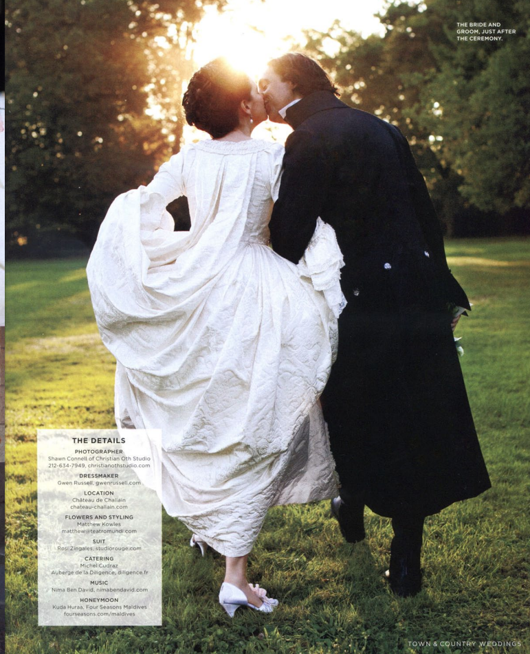
THE BRIDE AND GROOM, JUST AFTER THE CEREMONY.