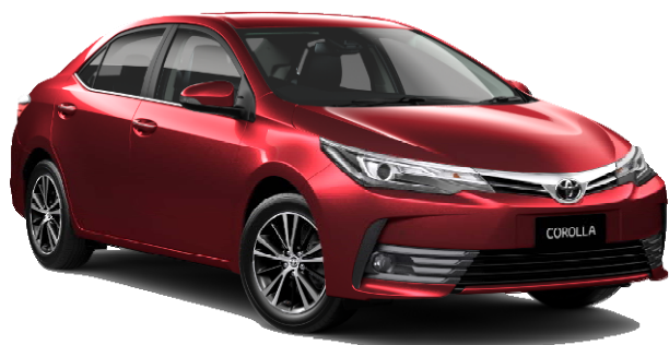
Toyota Corolla Sedan