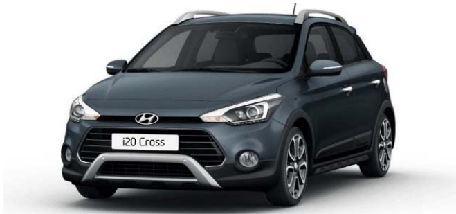
Hyundai i20 Cross